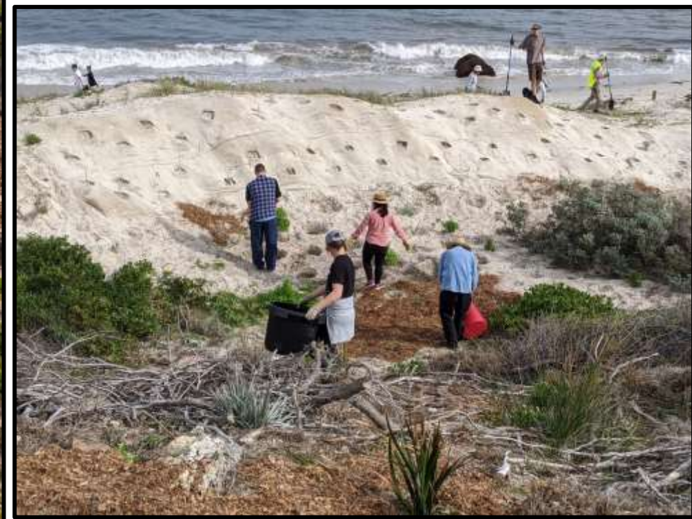
Extending north from Dutch Inn -also south from Sydney St and Victoria Station