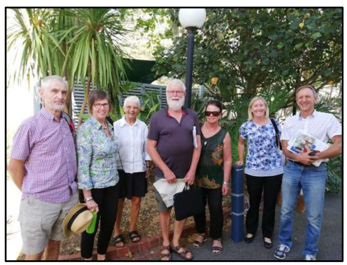
Counting weeds that have